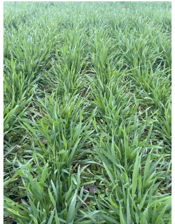
Figure 1: Winter wheat in Princeton, KY 2/24/23. Despite the bitter cold temperatures in late December 2022, the wheat stands are good. Weed populations are equally "nice".

Second: To compare how warm this winter has been, we examined the growing degree days (base temperature of 32°F) from December 1 to February 28 for this year and the