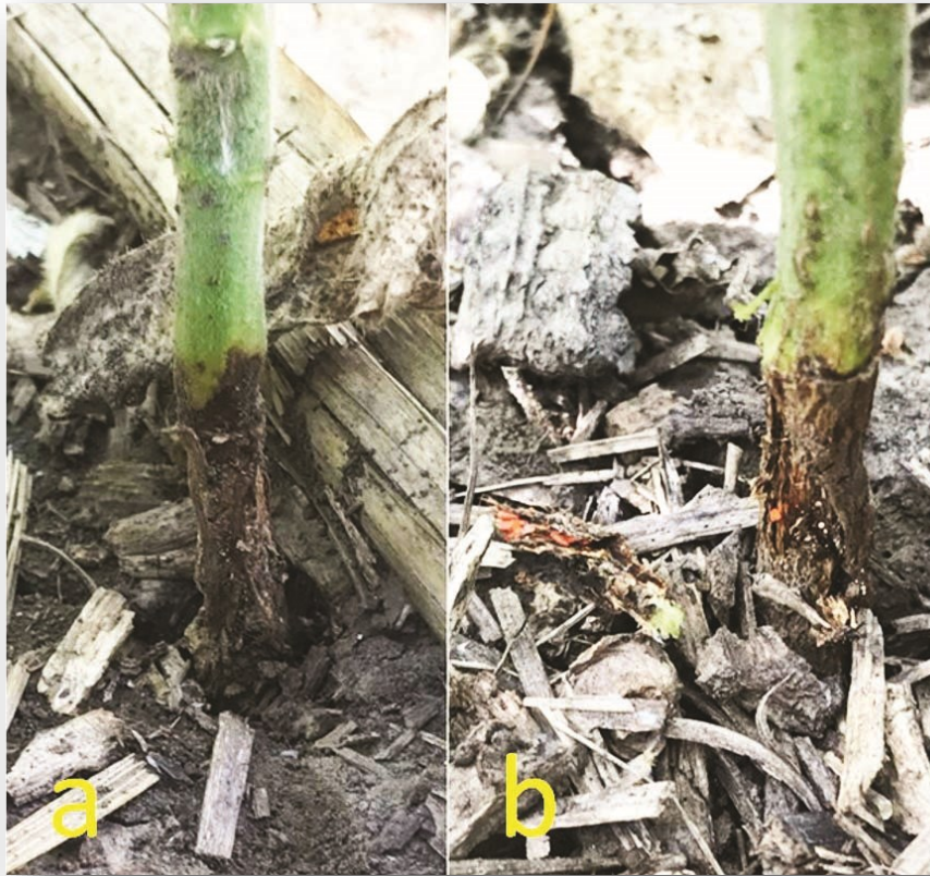
Figure 3. Soybean plant with (a) dark discoloration at the base of the stem and (b) the presence of orange gall midge after removing outer plant tissue.