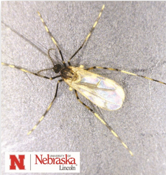
Figure 5. Adult midge, approximately ¼ inch in length with an orange abdomen (not visible under the wings). A key characteristic is the black and white banding on its legs.

Cultural practices can be tools that may be used by farmers. McMechan reported in 2019 that late planting soybeans (late June) did not show infestations compared to earlier planting dates in Nebraska. He reported that maturity groups 1 and 2 showed visible signs of damage at or near the soil surface, whereas groups 3 and 4 showed signs of plant damage in the axils of the trifoliolate leaves approximately 6-8 inches from the soil surface.