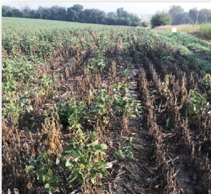
Figure 1. Soybean plants showing soybean gall midge damage in field edges.

In 2018 and 2019, infestations were much earlier than previous reports. In late June infested soybean plants were already showing signs of necrosis and wilting and, there were documented yield losses of up to 90% to 100% in those border plants, and yield loss averages reached up to 30% in some infested fields in 2018.