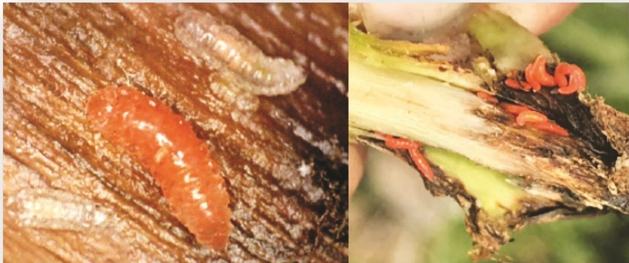
Figure 4. Soybean gall midge larvae. Earlier instars are whitish, and later instars are orange to red